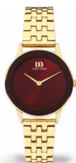
BURGUNDY LINK IV97Q1288