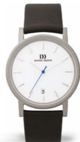
STRIPE WHITE BLACK MEDIUM IQ12Q171