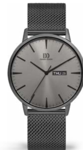
ALL GREY MESH IQ66Q1267