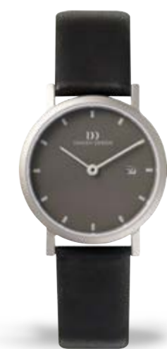
DARK GREY STRIPE SMALL IV13Q272