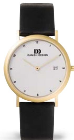
SATIN GOLD MEDIUM IQ15Q272