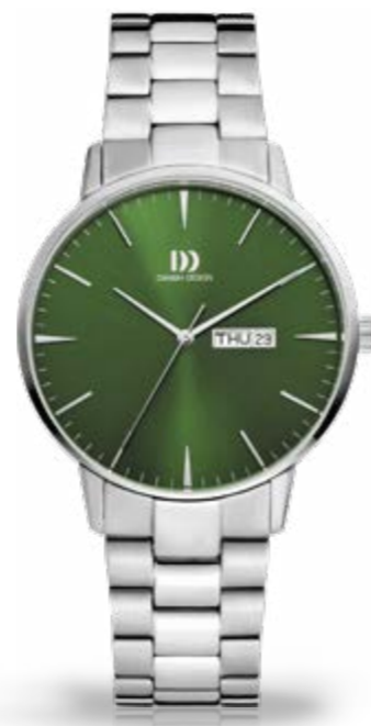
GREEN LINK 1Q97Q1267