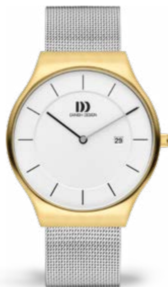
TWO-TONE LARGE IQ65Q1259