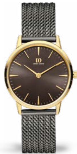
GREY GOLD MESH IV70Q1251