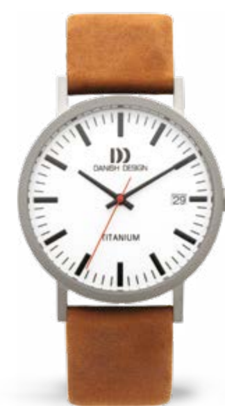
WHITE CAMEL DATE LARGE IQ31Q1273