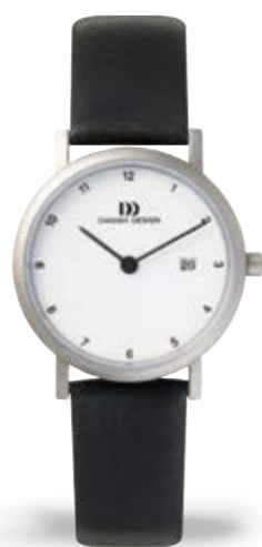
WHITE SMALL IV12Q272