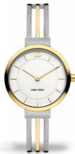
TWO-TONE STRIPE IV65Q1277