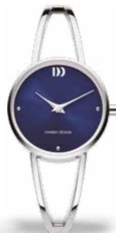
SILVER BLUE IV68Q1230

CASE MATERIAL: Stainless Steel CASE DIAMETER: 27mm STRAP MATERIAL: Stainless Steel GLASS: Mineral Crystal WATER RESISTANCE: 3 ATM CASE THICKNESS: 6,5mm STRAP LOCK: Jewellery clasp STRAP WIDTH: 15mm MOVEMENT: Miyota 1L22