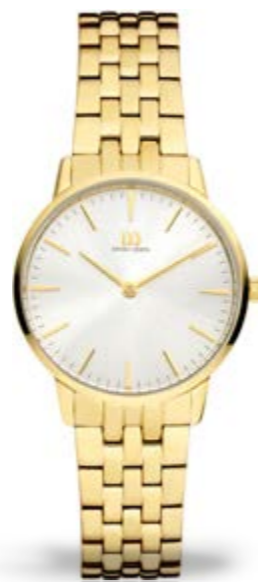
GOLD LINK IV91Q1251