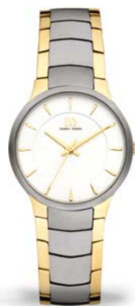
TWO-TONE SILVER SMALL IV65Q1275