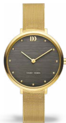
GOLD GREY BARK IV08Q1218