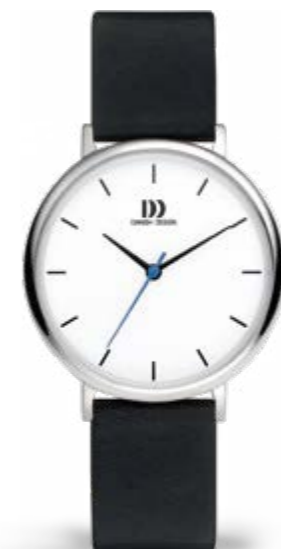
WHITE BLACK MEDIUM IV12Q1190