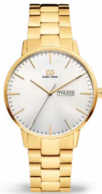
GOLD LINK 1Q91Q1267