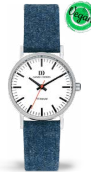
VEGAN NAVY SMALL IV42Q199