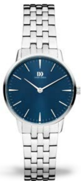
SILVER BLUE LINK IV98Q1251