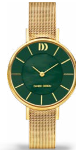
MOTHER OF PEARL GOLD GREEN IV09Q1167