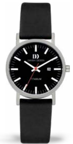
BLACK BLACK DATE SMALL IV23Q199