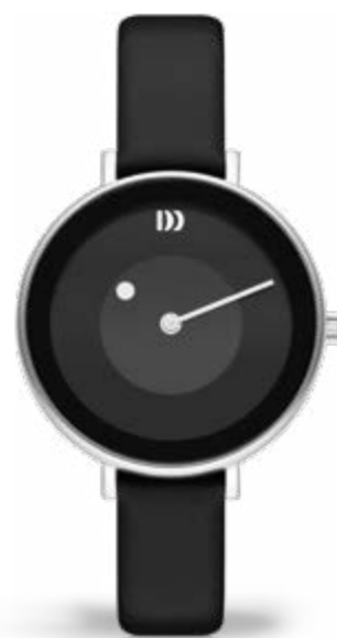
SILVER MEDIUM IV13Q1260