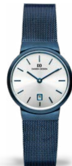
BLUE SMALL IV69Q971