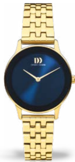
MIDNIGHT BLUE GOLD LINK IV96Q1288