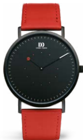
BLACK RED IQ24Q1274