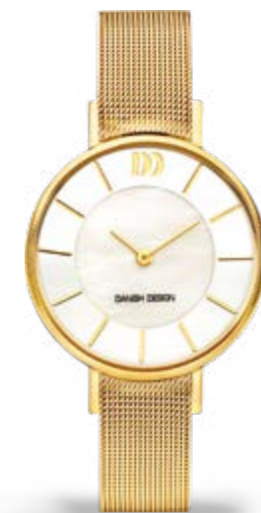
MOTHER OF PEARL GOLD IV05Q1167