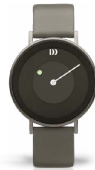
GREY LARGE IQ14Q1260