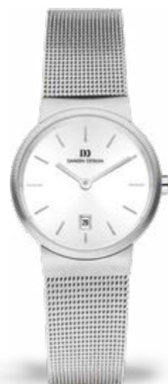
SILVER SMALL IV62Q971