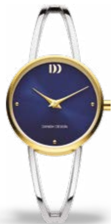
TWO-TONE BLUE IV73Q1230