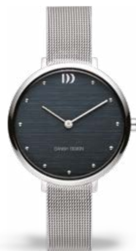
STEEL BLUE BARK IV69Q1218