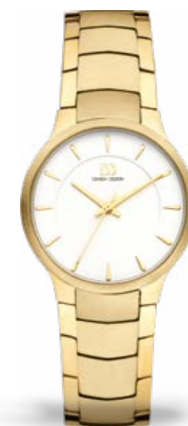
GOLD SMALL IV05Q1275