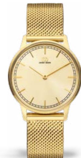
ALL GOLD MESH IV06Q1249