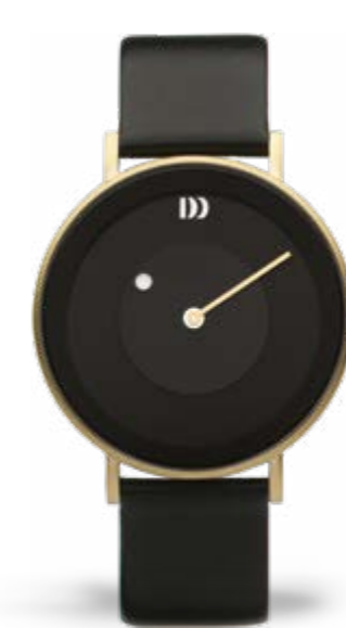
GOLD LARGE IQ11Q1260

CASE MATERIAL: Stainless Steel CASE DIAMETER: 35mm STRAP MATERIAL: Leather GLASS: Mineral Crystal WATER RESISTANCE: 3 ATM CASE THICKNESS: 6,8mm STRAP LOCK: Buckle STRAP WIDTH: 12mm MOVEMENT: Miyota 2025