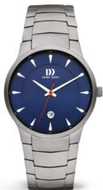
BLUE LARGE IQ68Q1275