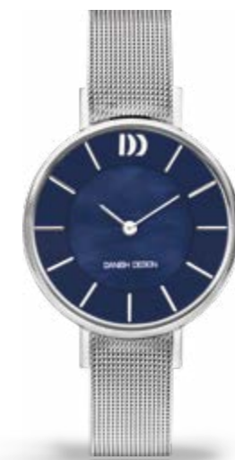
MOTHER OF PEARL BLUE IV69Q1167