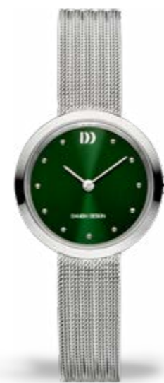
SILVER GREEN IV77Q1210

CASE MATERIAL: Stainless Steel CASE DIAMETER: 28mm STRAP MATERIAL: Mesh Stainless Steel GLASS: Mineral Crystal WATER RESISTANCE: 3 ATM CASE THICKNESS: 6,2mm STRAP LOCK: Push clasp STRAP WIDTH: 12mm MOVEMENT: Seiko VX50