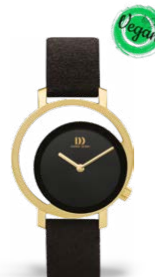
BLACK GOLD IV15Q1271