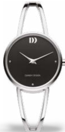
SILVER BLACK IV63Q1230