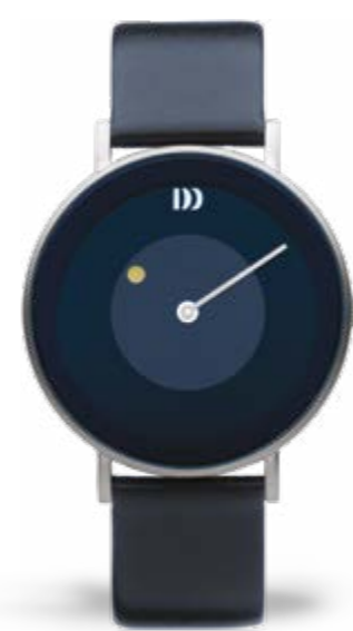
BLUE LARGE IQ22Q1260