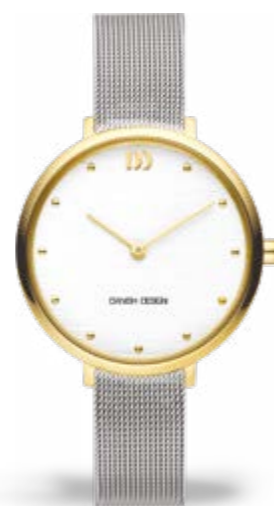
TWO-TONE SILVER BARK IV65Q1218