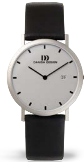
LIGHT GREY STRIPE MEDIUM IQ19Q272