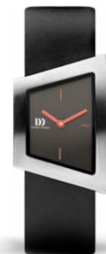
SILVER BLACK IV24Q1207