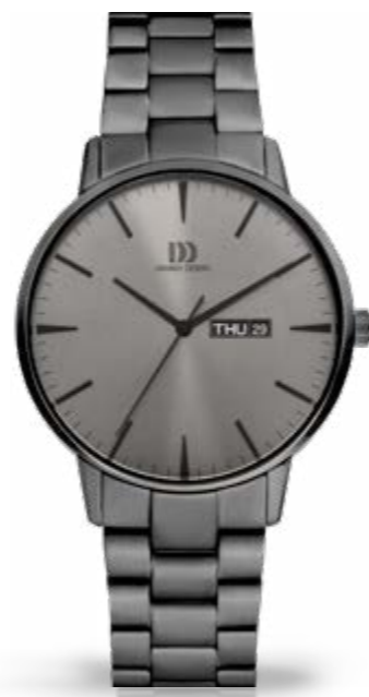
ALL GREY LINK 1Q96Q1267