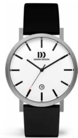
SILVER LARGE IQ12Q1108