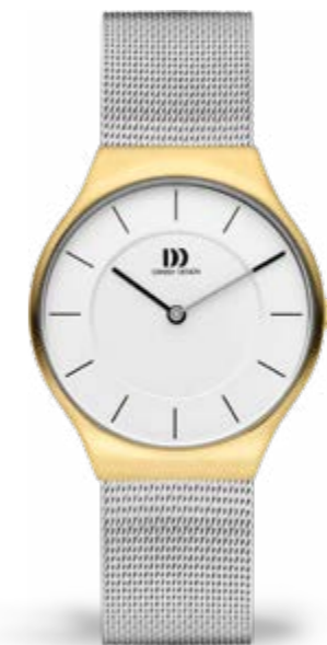
TWO-TONE MEDIUM IV65Q1259