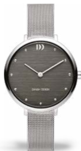
STEEL GREY BARK IV64Q1218