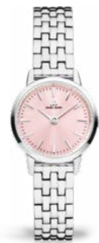
SILVER PINK LINK IV97Q1268