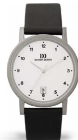
WHITE BLACK MEDIUM IQ12Q170