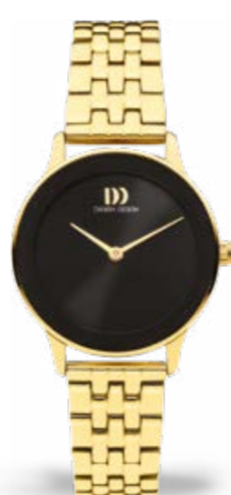
BLACK LINK IV99Q1288