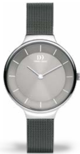
GREY SILVER MESH IV64Q1272