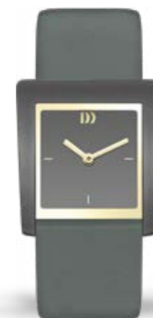
DARK GREY GOLD IV44Q1257