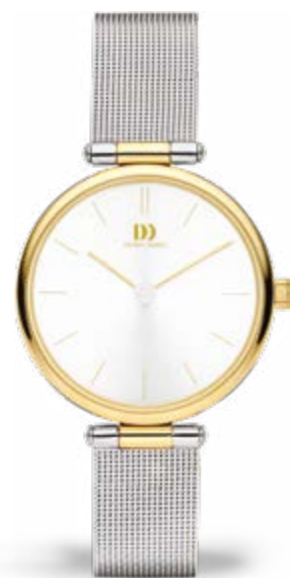
TWO-TONE GOLD MESH IV65Q1269

CASE MATERIAL: Stainless Steel CASE DIAMETER: 34mm STRAP MATERIAL: Mesh Stainless Steel GLASS: Mineral Crystal WATER RESISTANCE: 3 ATM CASE THICKNESS: 6,1mm STRAP LOCK: Push clasp STRAP WIDTH: 16mm MOVEMENT: Miyota 1L22