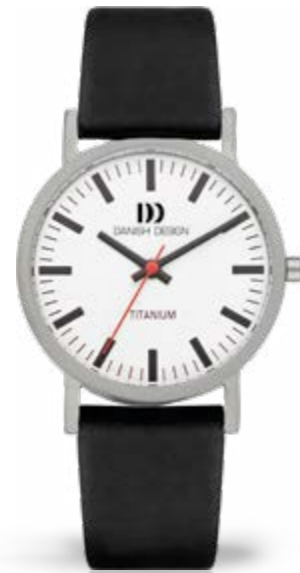
WHITE BLACK MEDIUM IQ14Q199

CASE MATERIAL: Titanium CASE DIAMETER: 30mm / 35mm STRAP MATERIAL: Leather GLASS: Mineral Crystal WATER RESISTANCE: 3 ATM CASE THICKNESS: 6,4mm / 6,8mm STRAP LOCK: Buckle STRAP WIDTH: 16mm / 18mm MOVEMENT: Seiko VX51