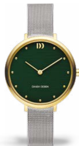
TWO-TONE GREEN BARK IV76Q1218