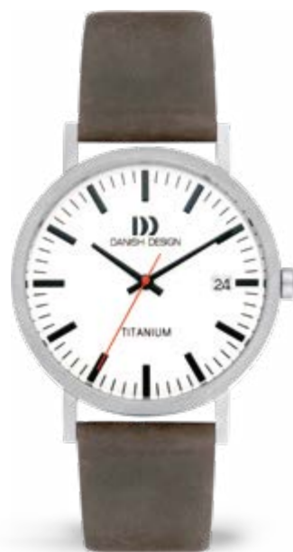
WHITE GREY DATE LARGE IQ14Q1273