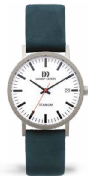
WHITE BLUE DATE MEDIUM IQ30Q199