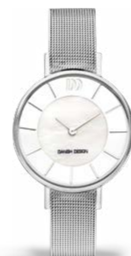
MOTHER OF PEARL SILVER IV62Q1167