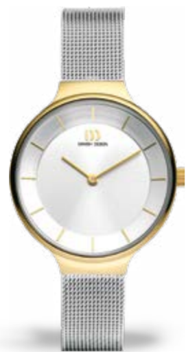
TWO-TONE MESH IV65Q1272

CASE MATERIAL: Stainless Steel CASE DIAMETER: 32mm STRAP MATERIAL: Mesh Stainless Steel GLASS: Mineral Crystal WATER RESISTANCE: 3 ATM CASE THICKNESS: 6,95mm STRAP LOCK: Push clasp STRAP WIDTH: 12mm MOVEMENT: Miyota 2025