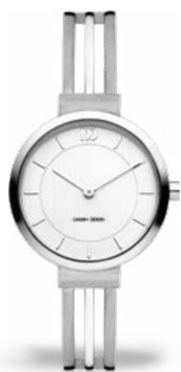
SILVER STRIPE IV62Q1277

CASE MATERIAL: Titanium CASE DIAMETER: 30mm STRAP MATERIAL: Titanium GLASS: Mineral Crystal WATER RESISTANCE: 3 ATM CASE THICKNESS: 6,2mm STRAP LOCK: Jewellery clasp STRAP WIDTH: 9mm MOVEMENT: Miyota GL20