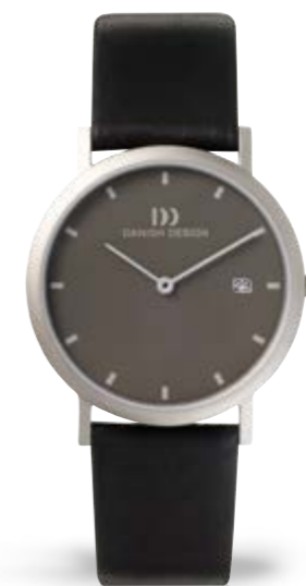
DARK GREY STRIPE MEDIUM IQ13Q272