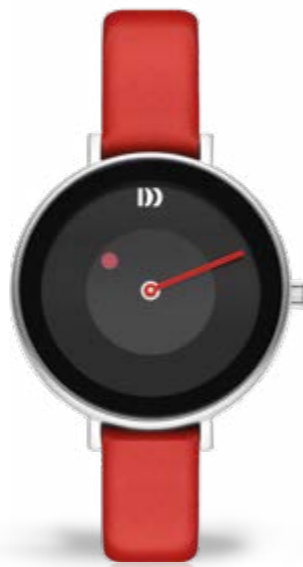
RED MEDIUM IV24Q1260