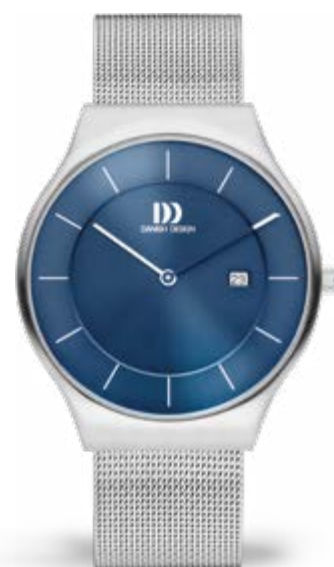
BLUE LARGE IQ68Q1259