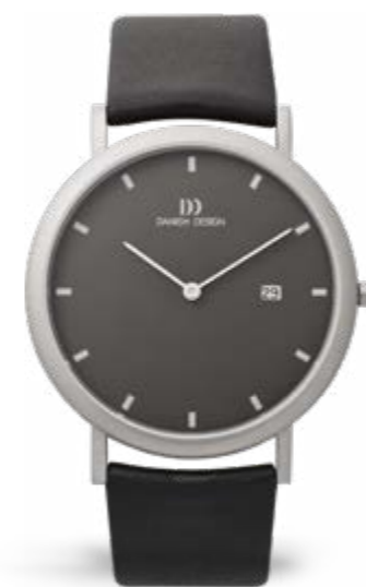
DARK GREY STRIPE LARGE IQ13Q881