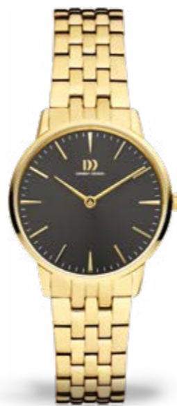
GOLD BLACK LINK IV99Q1251