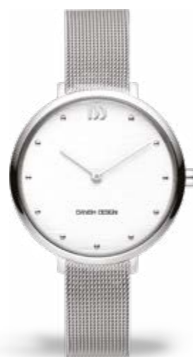
STEEL SILVER BARK IV62Q1218