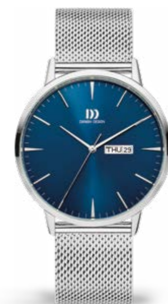
ROYAL BLUE MESH IQ68Q1267