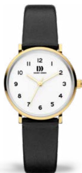
GOLD WHITE SMALL IV11Q1216