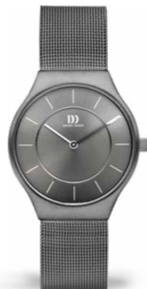
ALL GREY MEDIUM IV66Q1259