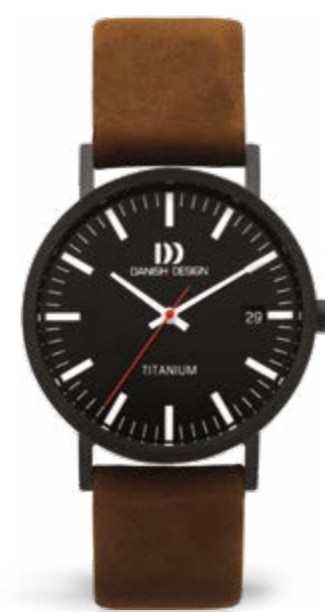
BLACK BROWN DATE LARGE IQ34Q1273

CASE MATERIAL: Titanium CASE DIAMETER: 35mm / 39mm STRAP MATERIAL: Leather GLASS: Mineral Crystal WATER RESISTANCE: 3 ATM CASE THICKNESS: 6,9mm STRAP LOCK: Buckle STRAP WIDTH: 18mm / 20mm MOVEMENT: Seiko VJ52 / Seiko VX32E FUNCTION: Date