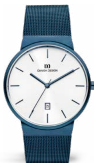
BLUE LARGE IQ69Q971