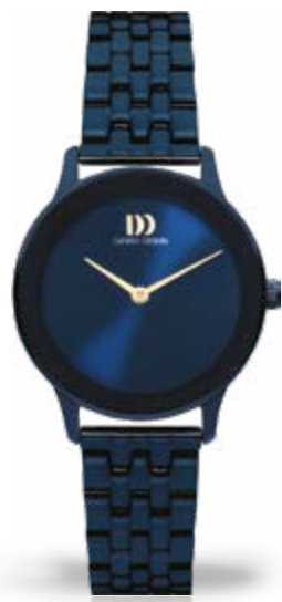
MIDNIGHT BLUE LINK