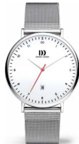
DATE WHITE SILVER LARGE IQ62Q1188