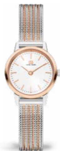
TWO-TONE ROSEGOLD IV67Q1268