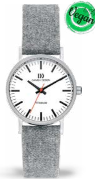
VEGAN LIGHT GREY SMALL IV41Q199