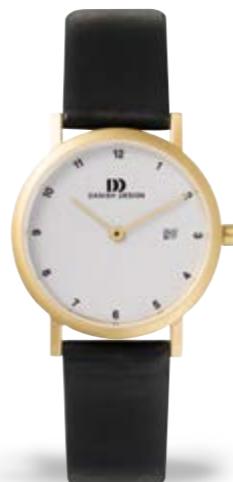
SATIN GOLD SMALL IV15Q272