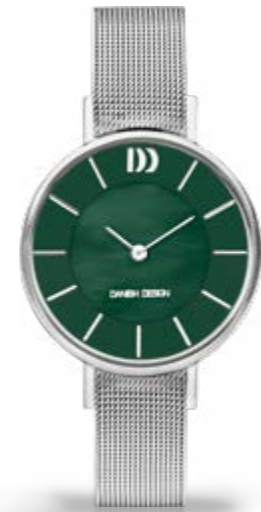
MOTHER OF PEARL GREEN IV77Q1167