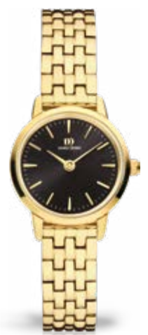
GOLD BLACK LINK IV99Q1268