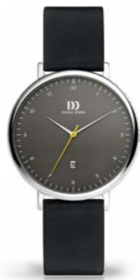
DATE GREY BLACK MEDIUM IV14Q1188