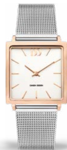
TWO-TONE ROSEGOLD MESH IV67Q1248