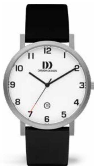
SILVER LARGE IQ12Q1107