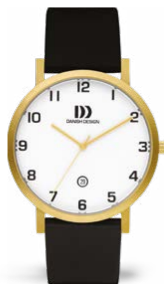
SATIN GOLD LARGE IQ15Q1107

CASE MATERIAL: Titanium CASE DIAMETER: 30mm / 40mm STRAP MATERIAL: Leather GLASS: Mineral Crystal WATER RESISTANCE: 3 ATM CASE THICKNESS: 6,0mm / 7,5mm STRAP LOCK: Buckle STRAP WIDTH: 16mm / 20mm MOVEMENT: Miyota GL30 / Miyota GM10 FUNCTION: Date