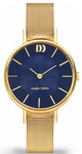
MOTHER OF PEARL GOLD BLUE IV72Q1167