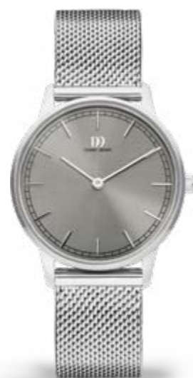
GREY MESH IV64Q1249