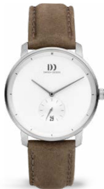
TAUPE WHITE IQ14Q1279