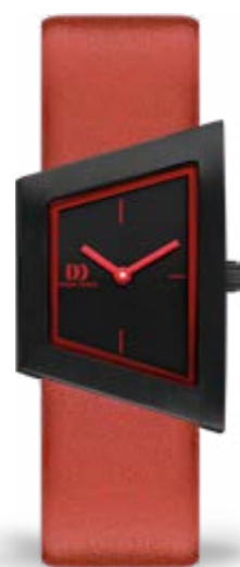
BLACK RED IV20Q1207