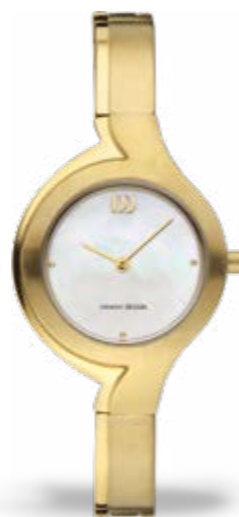
GOLD MOTHER OF PEARL IV05Q1148