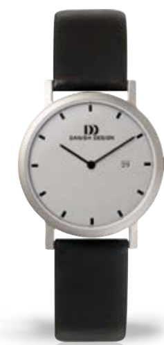
LIGHT GREY STRIPE SMALL IV19Q272