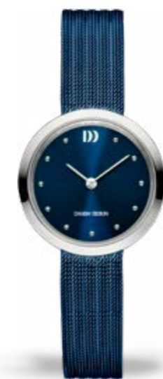
BLUE SILVER IV69Q1210