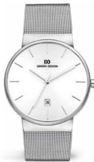
SILVER LARGE IQ62Q971

CASE MATERIAL: Stainless Steel CASE DIAMETER: 28mm / 40mm STRAP MATERIAL: Mesh Stainless Steel GLASS: Mineral Crystal WATER RESISTANCE: 5 ATM CASE THICKNESS: 7,1mm / 8,0mm STRAP LOCK: Push clasp STRAP WIDTH: 16mm / 23mm MOVEMENT: Miyota GL15 / Miyota 1M12 FUNCTION: Date