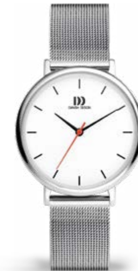
WHITE MEDIUM MESH IV62Q1190