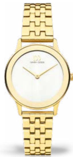
GOLD SILVER LINK