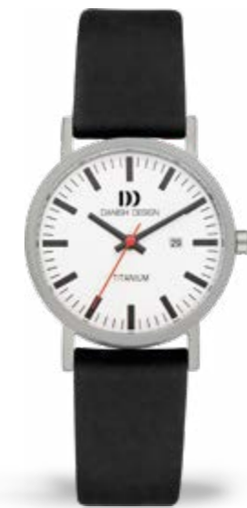
WHITE BLACK DATE SMALL IV24Q199