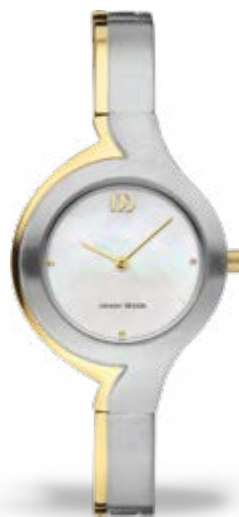
TWO-TONE MOTHER OF PEARL IV65Q1148