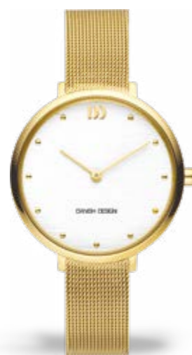
GOLD SILVER BARK IV05Q1218

CASE MATERIAL: Stainless Steel CASE DIAMETER: 33mm STRAP MATERIAL: Mesh Stainless Steel GLASS: Mineral Crystal WATER RESISTANCE: 3 ATM CASE THICKNESS: 6,3mm STRAP LOCK: Push clasp STRAP WIDTH: 12mm MOVEMENT: Seiko VX50