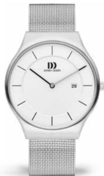
SILVER LARGE IQ62Q1259

CASE MATERIAL: Stainless Steel CASE DIAMETER: 40,5mm STRAP MATERIAL: Mesh Stainless Steel GLASS: Mineral Crystal WATER RESISTANCE: 3 ATM CASE THICKNESS: 7,7mm STRAP LOCK: Push clasp STRAP WIDTH: 20mm MOVEMENT: Miyota GM15 FUNCTION: Date