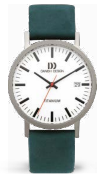
WHITE BLUE DATE LARGE IQ30Q1273