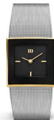
BLACK GOLD IV73Q973