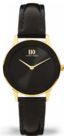
BLACK GOLD IV11Q1288

CASE MATERIAL: Stainless Steel CASE DIAMETER: 29mm STRAP MATERIAL: Leather / Stainless steel GLASS: Mineral Crystal WATER RESISTANCE: 3 ATM CASE THICKNESS: 6,2mm STRAP LOCK: Jewellery clasp STRAP WIDTH: 14mm MOVEMENT: Miyota GL22