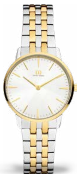
TWO-TONE LINK IV95Q1251