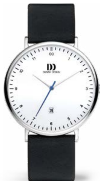
DATE WHITE BLACK LARGE IQ12Q1188

CASE MATERIAL: Stainless Steel CASE DIAMETER: 35mm / 41mm STRAP MATERIAL: Leather / Mesh Stainless Steel GLASS: Mineral Crystal WATER RESISTANCE: 5 ATM CASE THICKNESS: 8,5mm / 9,0mm STRAP LOCK: Buckle / Push clasp STRAP WIDTH: 16mm / 20mm MOVEMENT: Miyota GL10 / Miyota GM10 FUNCTION: Date