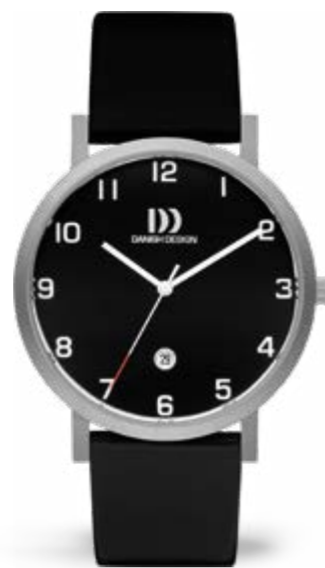
BLACK LARGE IQ13Q1107