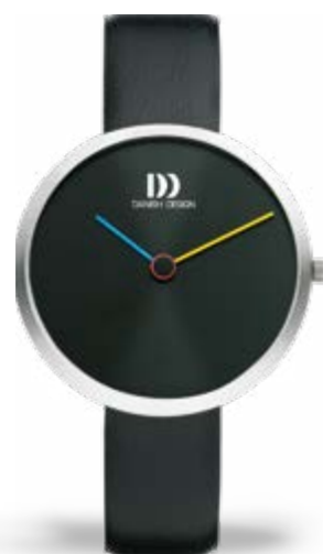
BLACK RBY IV23Q1261

CASE MATERIAL: Stainless Steel CASE DIAMETER: 36mm STRAP MATERIAL: Leather GLASS: Mineral Crystal WATER RESISTANCE: 3 ATM CASE THICKNESS: 7mm STRAP LOCK: Buckle STRAP WIDTH: 14mm MOVEMENT: Miyota 2025