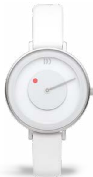
WHITE MEDIUM IV12Q1260