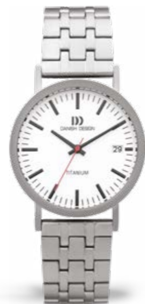
LINK WHITE DATE MEDIUM IQ92Q199