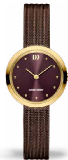
CHESTNUT GOLD IV74Q1210