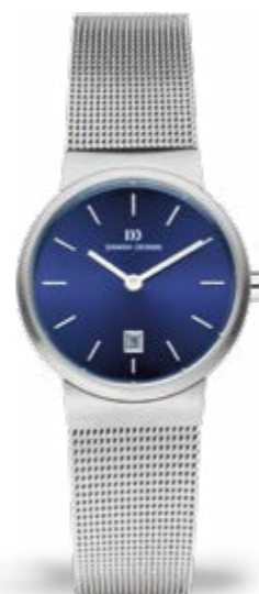
ROYAL BLUE SMALL IV68Q971