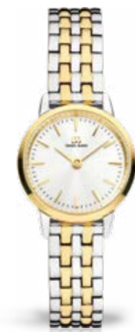
TWO-TONE GOLD LINK IV95Q1268