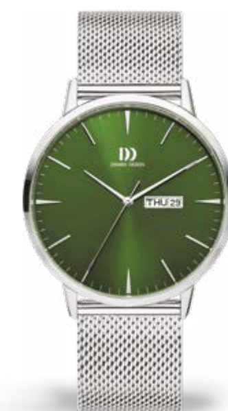
GREEN MESH IQ77Q1267