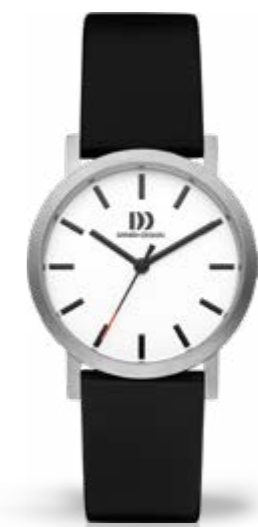
SILVER MEDIUM IV12Q1108