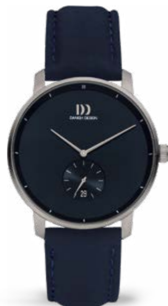
DONAU BLUE IQ22Q1279