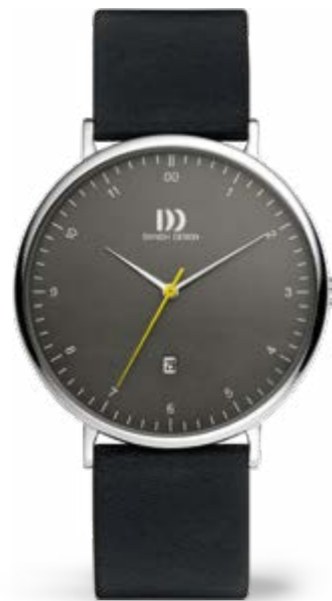
DATE GREY BLACK LARGE IQ14Q1188