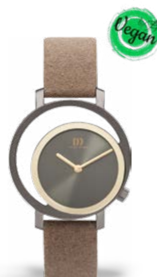
GREY GOLD IV16Q1271