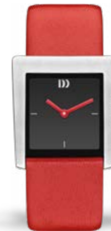
BLACK RED IV41Q1257