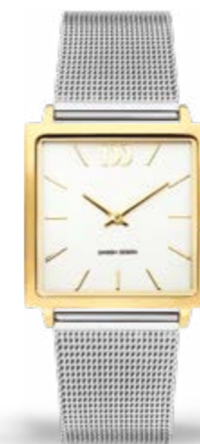
TWO-TONE GOLD MESH IV65Q1248