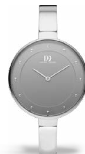
SILVER GREY IV64Q1143