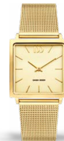
ALL GOLD MESH IV06Q1248