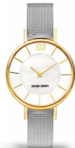
MOTHER OF PEARL TWO-TONE IV65Q1167