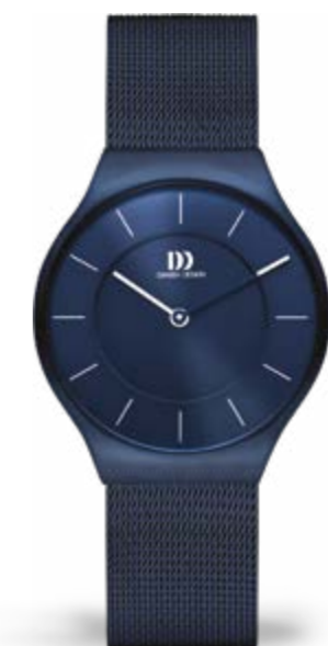
ALL BLUE MEDIUM IV69Q1259