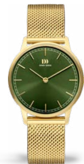
GREEN GOLD MESH IV09Q1249