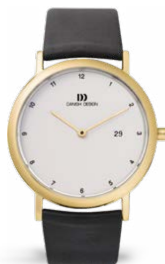
SATIN GOLD LARGE IQ15Q881

CASE MATERIAL: Titanium CASE DIAMETER: 28mm / 34mm STRAP MATERIAL: Leather GLASS: Mineral Crystal WATER RESISTANCE: 3 ATM CASE THICKNESS: 6,9mm STRAP LOCK: Buckle STRAP WIDTH: 15mm / 18mm MOVEMENT: Seiko VX32E FUNCTION: Date