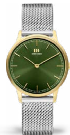
GREEN TWO-TONE MESH IV76Q1249