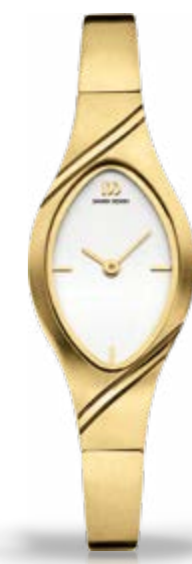
SATIN GOLD IV05Q1281