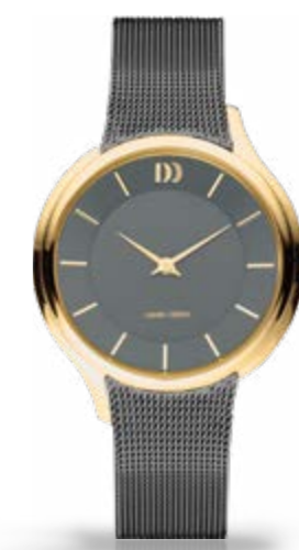
GREY GOLD IV70Q1194