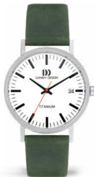
WHITE GREEN DATE LARGE IQ28Q1273