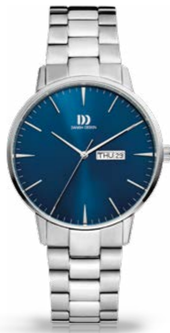
ROYAL BLUE LINK 1Q98Q1267