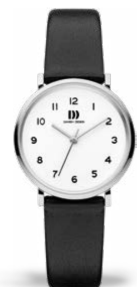
SILVER WHITE SMALL IV12Q1216