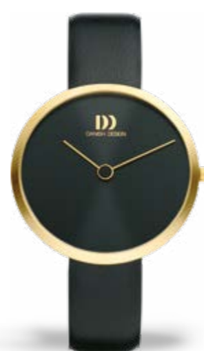
BLACK GOLD IV11Q1261