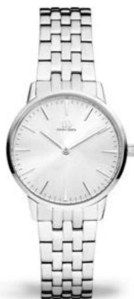
SILVER LINK IV92Q1251

CASE MATERIAL: Stainless Steel CASE DIAMETER: 32mm STRAP MATERIAL: Stainless Steel GLASS: Mineral Crystal WATER RESISTANCE: 3 ATM CASE THICKNESS: 6,2mm STRAP LOCK: Jewellery clasp STRAP WIDTH: 16mm MOVEMENT: Miyota GL20