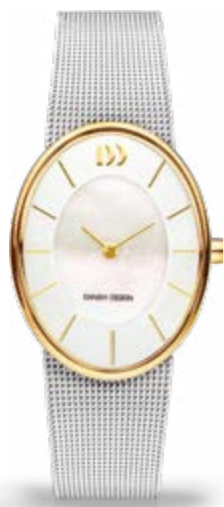
MOTHER OF PEARL TWO-TONE IV65Q1168

CASE MATERIAL: Stainless Steel CASE DIAMETER: 27mm STRAP MATERIAL: Mesh Stainless Steel GLASS: Mineral Crystal WATER RESISTANCE: 3 ATM CASE THICKNESS: 7,2mm STRAP LOCK: Push clasp STRAP WIDTH: 18mm MOVEMENT: Seiko VX50