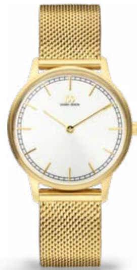
GOLD SILVER MESH IV05Q1249