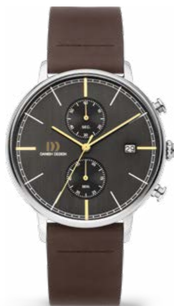
GREY GOLD IQ23Q1290