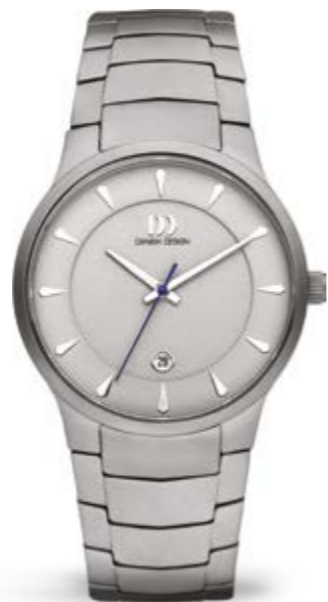
GREY LARGE IQ64Q1275