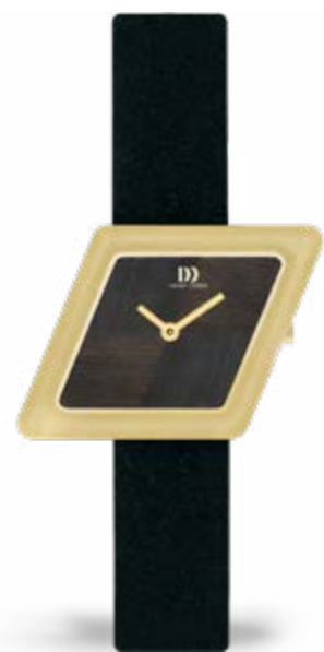
BLACK GOLD IV11Q1291

CASE MATERIAL: Stainless Steel CASE DIAMETER: 26,9mm STRAP MATERIAL: Leather GLASS: Mineral Crystal WATER RESISTANCE: 3 ATM CASE THICKNESS: 6mm STRAP LOCK: Buckle STRAP WIDTH: 14mm MOVEMENT: Miyota GL22