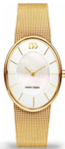
MOTHER OF PEARL GOLD IV05Q1168