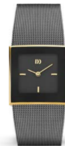
TWO-TONE GREY IV70Q973