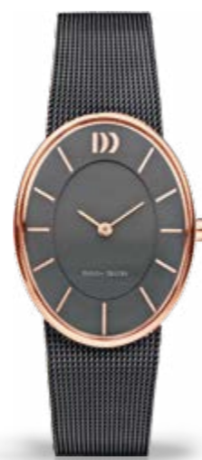
ROSE GOLD GREY IV71Q1168