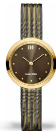
GREY GOLD IV66Q1210