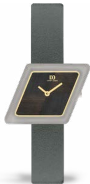
GREY GOLD IV16Q1291