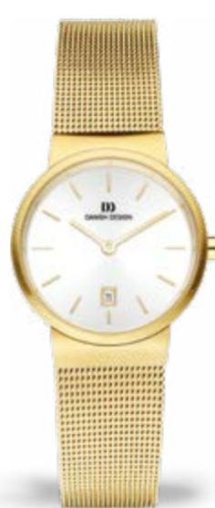
GOLD SMALL IV05Q971