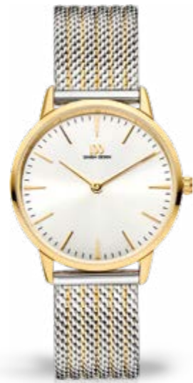
TWO-TONE MESH IV65Q1251