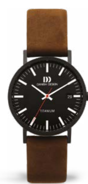
BLACK BROWN DATE MEDIUM IQ34Q199