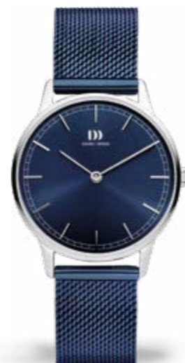
BLUE SILVER MESH IV69Q1249