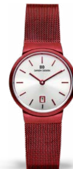
RED SMALL IV74Q971