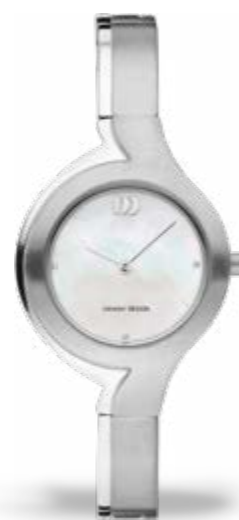
SILVER MOTHER OF PEARL IV62Q1148

CASE MATERIAL: Titanium CASE DIAMETER: 28mm STRAP MATERIAL: Titanium GLASS: Mineral Crystal WATER RESISTANCE: 3 ATM CASE THICKNESS: 6,5mm STRAP LOCK: Jewellery clasp STRAP WIDTH: 8mm MOVEMENT: Ronda 762