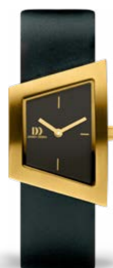
GOLD BLACK IV11Q1207