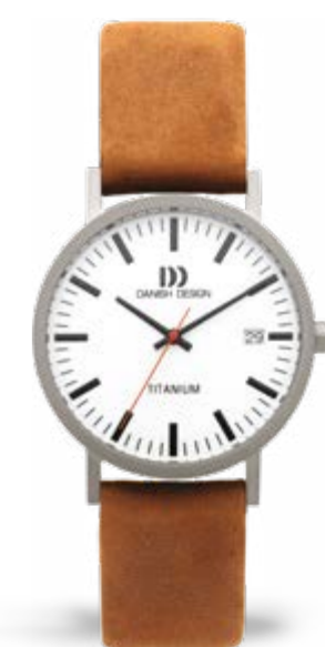
WHITE CAMEL DATE MEDIUM IQ31Q199