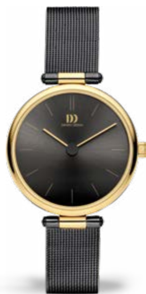
GREY GOLD MESH IV70Q1269