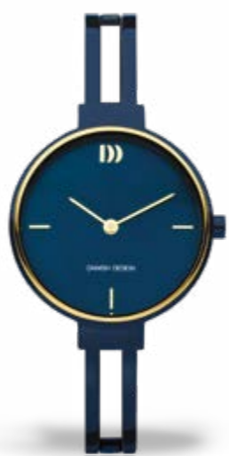
BLUE GOLD IV72Q1265