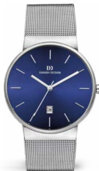
ROYAL BLUE LARGE IQ68Q971