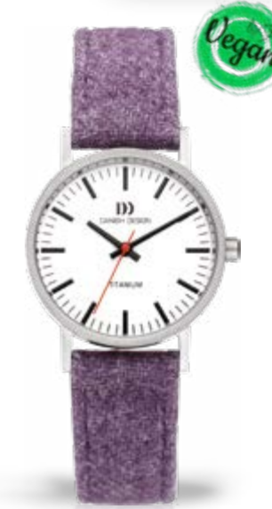
VEGAN LAVENDER SMALL IV43Q199