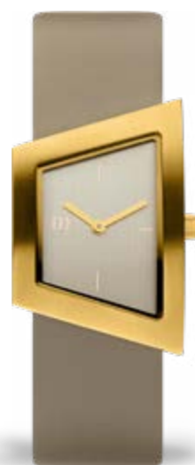
GOLD TAN IV15Q1207