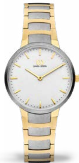
TWO-TONE SMALL IV65Q1278