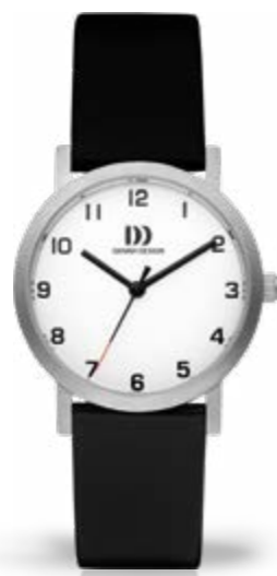
SILVER MEDIUM IV12Q1107