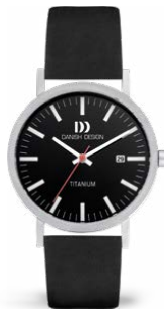
BLACK BLACK DATE LARGE IQ13Q1273

CASE MATERIAL: Titanium CASE DIAMETER: 39mm STRAP MATERIAL: Leather GLASS: Mineral Crystal WATER RESISTANCE: 3 ATM CASE THICKNESS: 6,9mm STRAP LOCK: Buckle STRAP WIDTH: 20mm MOVEMENT: Seiko VJ52 FUNCTION: Date