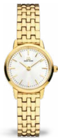
GOLD LINK IV91Q1268