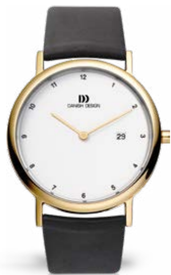
GOLD BLACK LARGE IQ10Q881