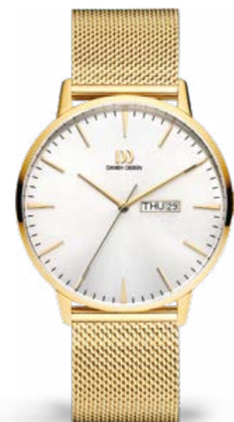
GOLD MESH IQ05Q1267

CASE MATERIAL: Stainless Steel CASE DIAMETER: 41mm STRAP MATERIAL: Mesh Stainless Steel GLASS: Mineral Crystal WATER RESISTANCE: 3 ATM CASE THICKNESS: 7,2mm STRAP LOCK: Push clasp STRAP WIDTH: 20mm MOVEMENT: Miyota GM00 FUNCTION: Day & Date