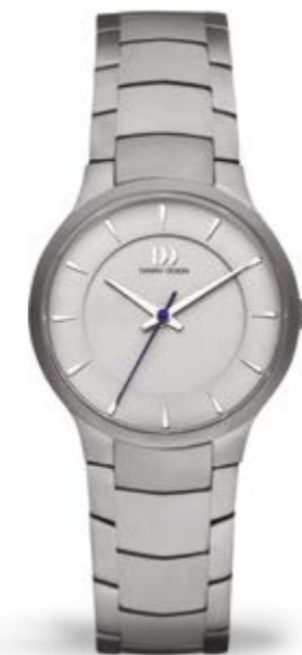
GREY SMALL IV64Q1275