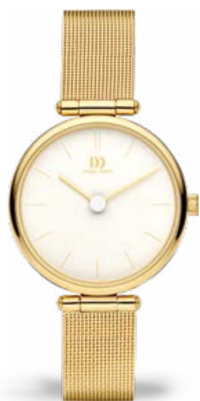
GOLD MESH IV05Q1269