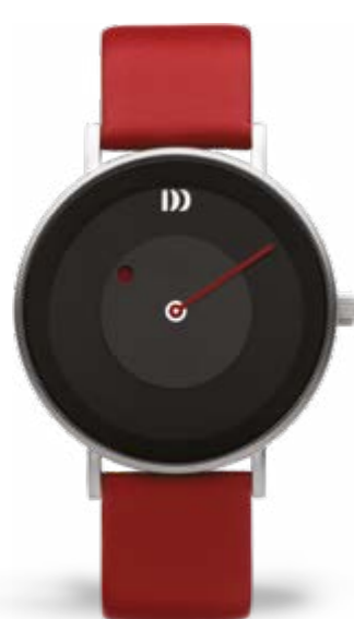
RED LARGE IQ24Q1260