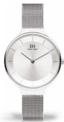
SILVER MESH IV62Q1272