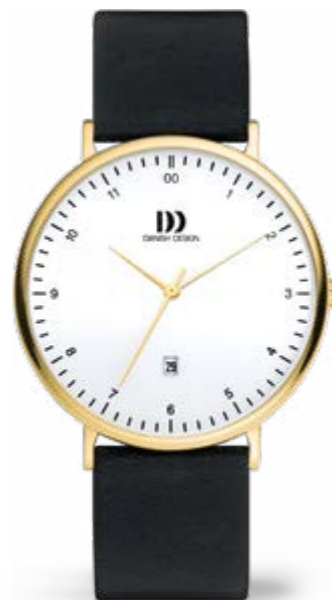
DATE GOLD BLACK LARGE IQ15Q1188