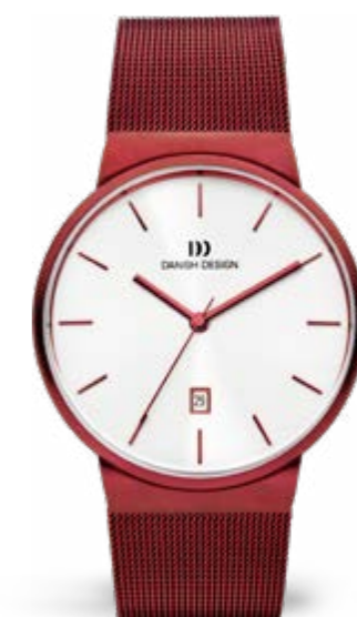
RED LARGE IQ74Q971