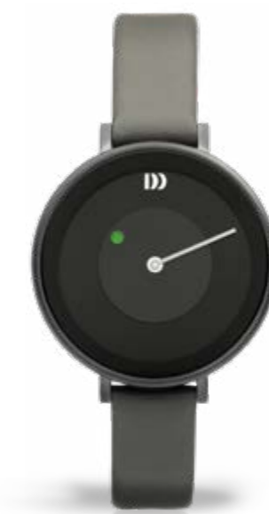
GREY MEDIUM IV14Q1260