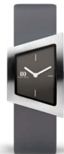
SILVER GREY IV14Q1207