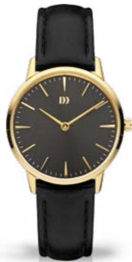
BLACK GOLD IV11Q1251