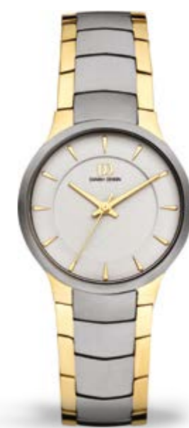
TWO-TONE GREY SMALL IV73Q1275