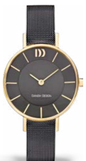
GOLD GREY IV70Q1167