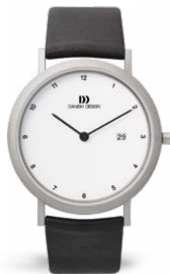
WHITE LARGE IQ12Q881

CASE MATERIAL: Titanium CASE DIAMETER: 27mm / 34mm / 39mm STRAP MATERIAL: Leather GLASS: Mineral Crystal WATER RESISTANCE: 3 ATM CASE THICKNESS: 6,0mm STRAP LOCK: Buckle STRAP WIDTH: 14mm / 18mm / 20mm MOVEMENT: Miyota 9T15 / Miyota 9U15 FUNCTION: Date