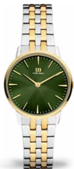
TWO-TONE GOLD GREEN LINK IV90Q1251