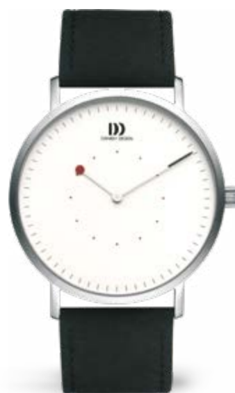
SILVER BLACK IQ12Q1274

CASE MATERIAL: Stainless Steel CASE DIAMETER: 41,5mm STRAP MATERIAL: Leather GLASS: Mineral Crystal WATER RESISTANCE: 3 ATM CASE THICKNESS: 7,1mm STRAP LOCK: Buckle STRAP WIDTH: 22mm MOVEMENT: Miyota 2025