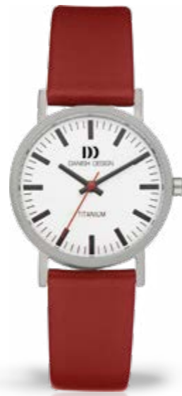
WHITE RED SMALL IV19Q199