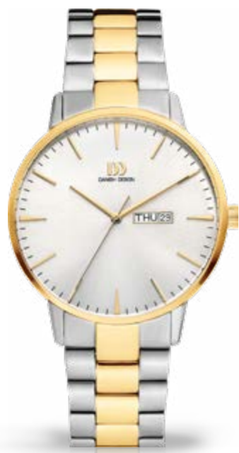
TWO TONE LINK 1Q95Q1267

CASE MATERIAL: Stainless Steel CASE DIAMETER: 41mm STRAP MATERIAL: Stainless Steel GLASS: Mineral Crystal WATER RESISTANCE: 3 ATM CASE THICKNESS: 7,2mm STRAP LOCK: Butterfly clasp STRAP WIDTH: 20mm MOVEMENT: Miyota GM00 FUNCTION: Day & Date