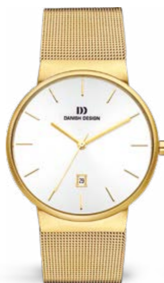
GOLD LARGE IQ05Q971