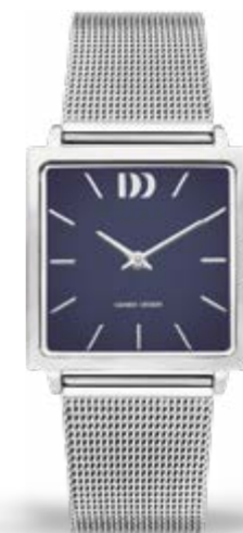
SILVER BLUE MESH IV68Q1248