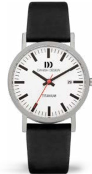
WHITE BLACK DATE MEDIUM IQ24Q199

CASE MATERIAL: Titanium CASE DIAMETER: 30mm / 35mm STRAP MATERIAL: Leather / Titanium GLASS: Mineral Crystal WATER RESISTANCE: 3 ATM CASE THICKNESS: 6,4mm / 6,8mm STRAP LOCK: Buckle STRAP WIDTH: 16mm / 18mm MOVEMENT: Seiko VX82 / Seiko VX32E FUNCTION: Date