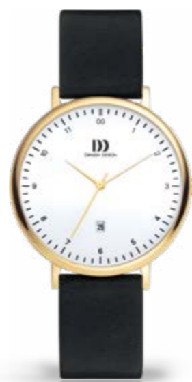
DATE GOLD BLACK MEDIUM IV15Q1188