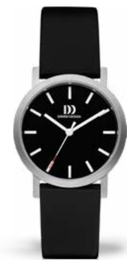
BLACK MEDIUM IV13Q1108