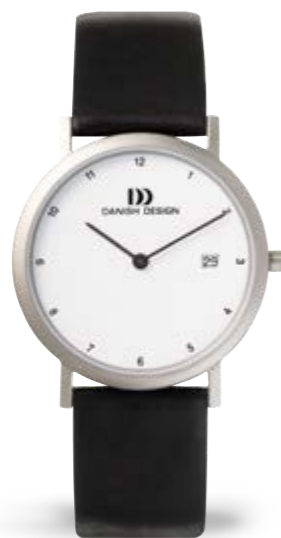
WHITE MEDIUM IQ12Q272