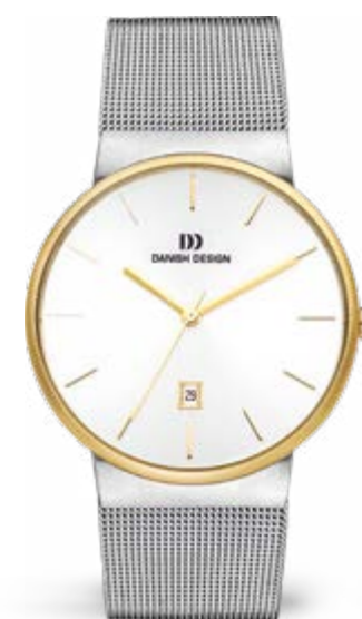
TWO-TONE LARGE IQ65Q971