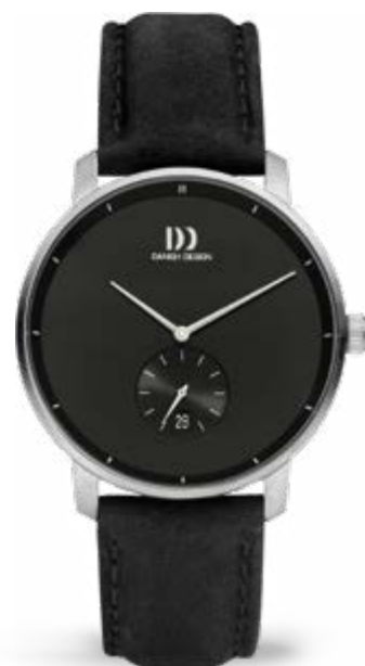
BLACK BLACK IQ13Q1279

CASE MATERIAL: Titanium CASE DIAMETER: 40mm STRAP MATERIAL: Leather GLASS: Mineral Crystal WATER RESISTANCE: 5 ATM CASE THICKNESS: 8,8mm STRAP LOCK: Buckle STRAP WIDTH: 20mm MOVEMENT: Miyota 0T45 FUNCTION: Date