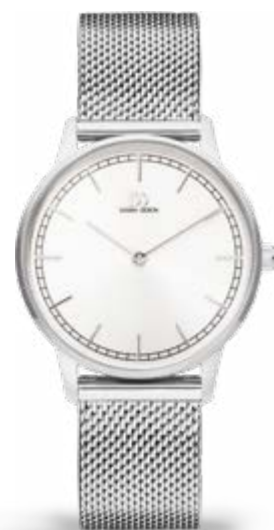
SILVER MESH IV62Q1249

CASE MATERIAL: Stainless Steel CASE DIAMETER: 32mm STRAP MATERIAL: Mesh Stainless Steel GLASS: Mineral Crystal WATER RESISTANCE: 3 ATM CASE THICKNESS: 6,2mm STRAP LOCK: Push clasp STRAP WIDTH: 16mm MOVEMENT: Miyota GL20