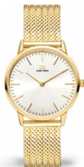
GOLD MESH IV05Q1251