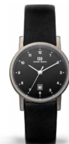
BLACK SMALL IV13Q170