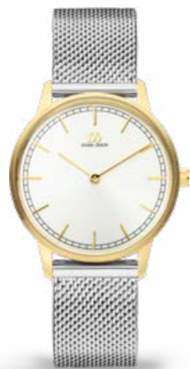
TWO-TONE MESH IV65Q1249