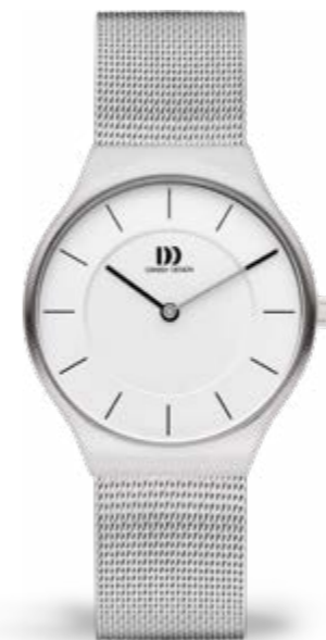
SILVER MEDIUM IV62Q1259

CASE MATERIAL: Stainless Steel CASE DIAMETER: 34mm STRAP MATERIAL: Mesh Stainless Steel GLASS: Mineral Crystal WATER RESISTANCE: 3 ATM CASE THICKNESS: 7,5mm STRAP LOCK: Push clasp STRAP WIDTH: 16mm MOVEMENT: Miyota 2025