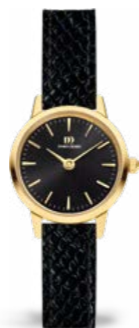
GOLD BLACK IV11Q1268