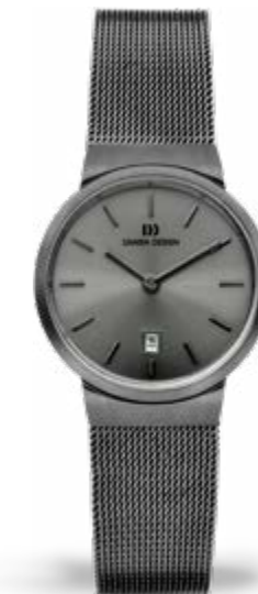
ALL GREY SMALL IV64Q971