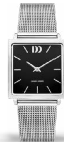
SILVER BLACK MESH IV63Q1248