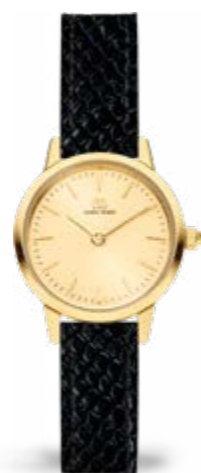
ALL GOLD BLACK IV19Q1268