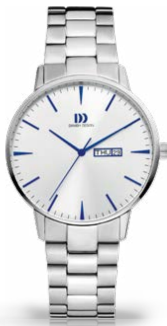
SILVER COBALT LINK 1Q90Q1267