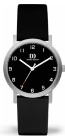
BLACK MEDIUM IV13Q1107