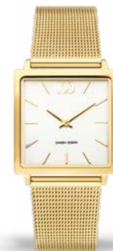
GOLD MESH IV05Q1248