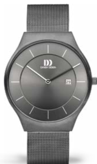
ALL GREY LARGE IQ66Q1259