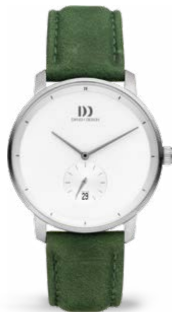
GREEN WHITE IQ28Q1279