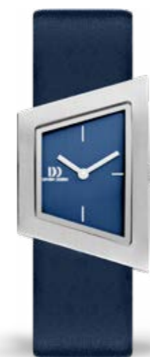
BLUE BLUE IV22Q1207