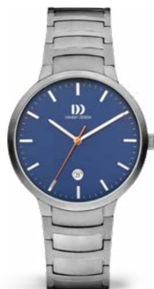
BLUE LARGE IQ68Q1278