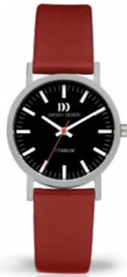
BLACK RED SMALL IV21Q199