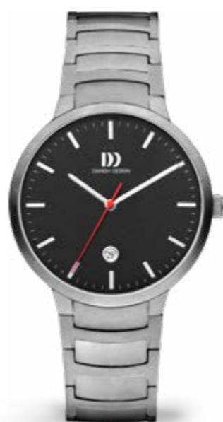
BLACK LARGE IQ63Q1278