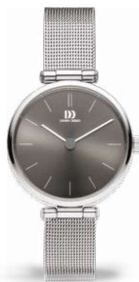
SILVER GREY MESH IV64Q1269