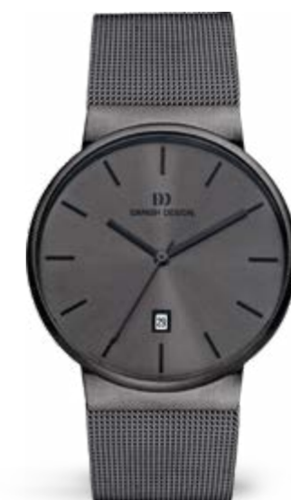
ALL GREY LARGE IQ64Q971