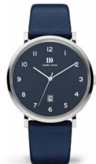
SILVER BLUE LARGE IQ22Q1216