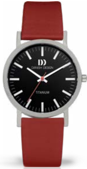
BLACK RED MEDIUM IQ21Q199