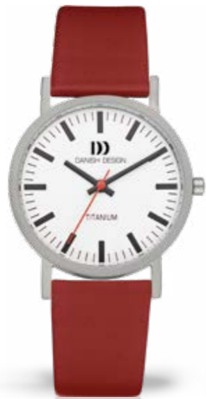
WHITE RED MEDIUM IQ19Q199