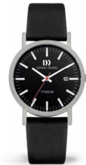
BLACK BLACK DATE MEDIUM IQ23Q199