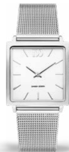
SILVER MESH IV62Q1248

CASE MATERIAL: Stainless Steel CASE DIMENSIONS: 26,5 / 26,5mm STRAP MATERIAL: Mesh Stainless Steel GLASS: Mineral Crystal WATER RESISTANCE: 3 ATM CASE THICKNESS: 7,5mm STRAP LOCK: Push clasp STRAP WIDTH: 18mm MOVEMENT: Ronda 762