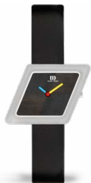
BLACK RBY IV23Q1291