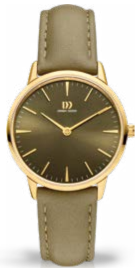
OLIVE GOLD IV32Q1251