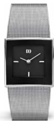
SILVER BLACK IV63Q973