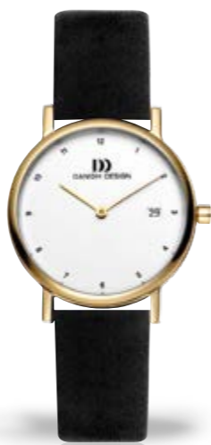
GOLD BLACK SMALL IV10Q272