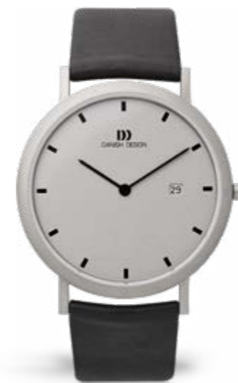
LIGHT GREY STRIPE LARGE IQ19Q881