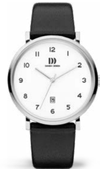
SILVER WHITE LARGE IQ12Q1216