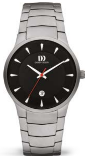
BLACK LARGE IQ63Q1275

CASE MATERIAL: Titanium CASE DIAMETER: 39mm STRAP MATERIAL: Titanium GLASS: Sapphire Crystal WATER RESISTANCE: 5 ATM CASE THICKNESS: 7,5mm STRAP LOCK: Folding clasp STRAP WIDTH: 24mm MOVEMENT: Miyota GM10 FUNCTION: Date