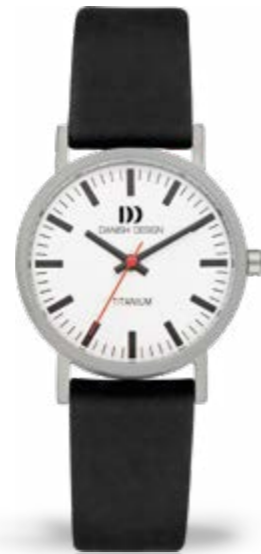
WHITE BLACK SMALL IV14Q199