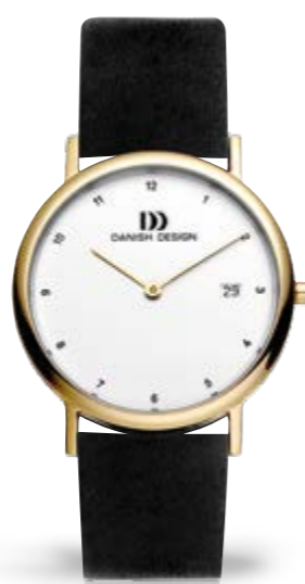
GOLD BLACK MEDIUM IQ10Q272