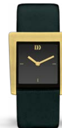
BLACK GOLD IV45Q1257