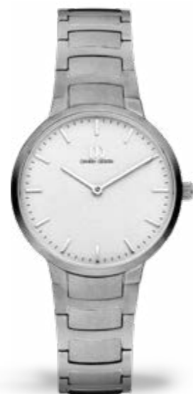
SILVER SMALL IV62Q1278

CASE MATERIAL: Titanium CASE DIAMETER: 32mm / 39mm STRAP MATERIAL: Titanium GLASS: Sapphire Crystal WATER RESISTANCE: 5 ATM CASE THICKNESS: 7,0mm / 7,5mm STRAP LOCK: Folding clasp STRAP WIDTH: 16mm / 20mm MOVEMENT: Seiko VJ20 / Seiko VJ32 FUNCTION: Date (gents)