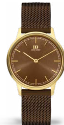
GOLD BROWN GOLD MESH IV74Q1249