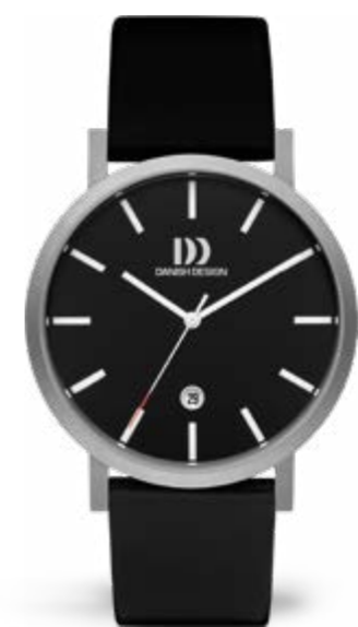
BLACK LARGE IQ13Q1108