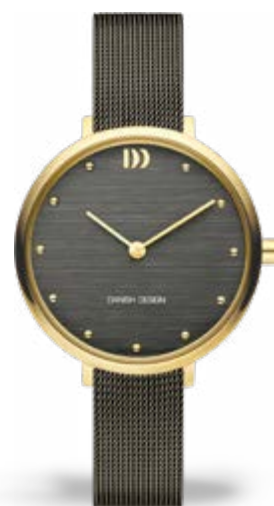
GOLD GREY GREY BARK IV70Q1218