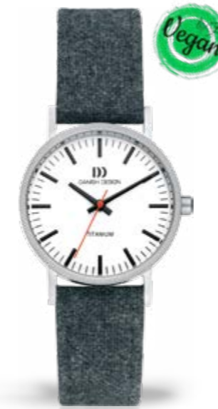
VEGAN DARK GREY SMALL IV40Q199