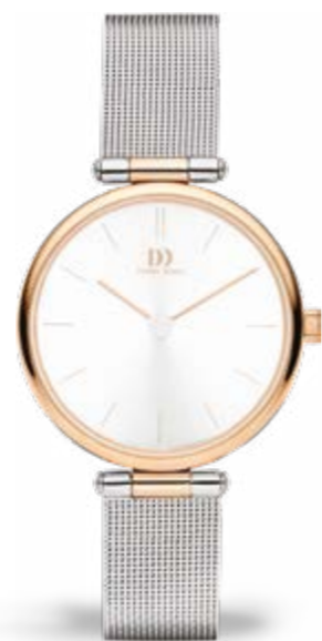
TWO-TONE ROSEGOLD MESH IV67Q1269