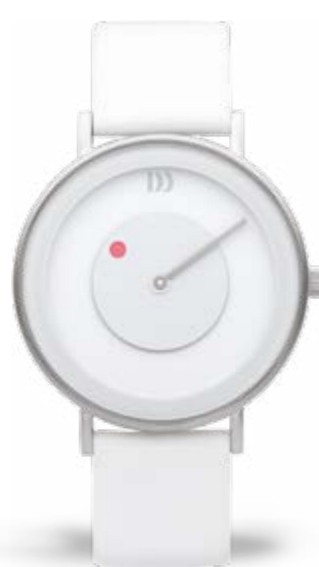
WHITE LARGE IQ12Q1260