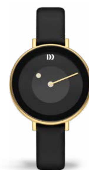
GOLD MEDIUM IV11Q1260