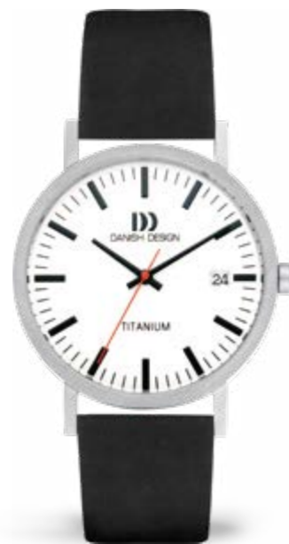
WHITE BLACK DATE LARGE IQ12Q1273