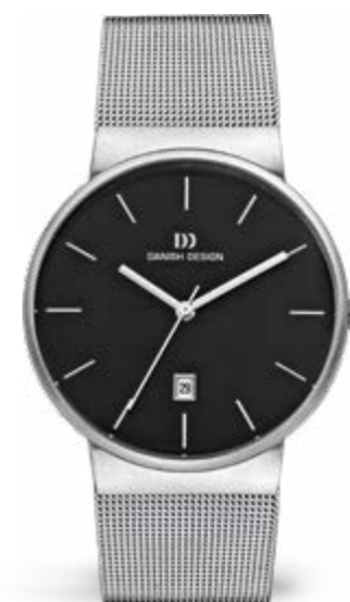
BLACK LARGE IQ63Q971