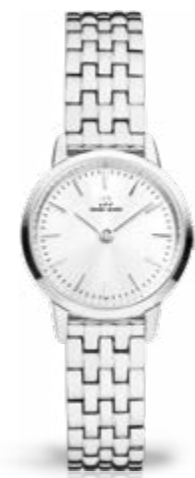
SILVER LINK IV92Q1268