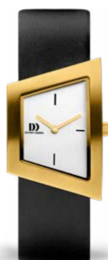
GOLD SILVER IV10Q1207