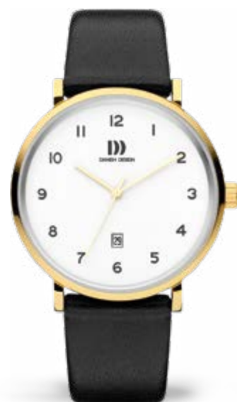
GOLD WHITE LARGE IQ11Q1216

CASE MATERIAL: Stainless Steel CASE DIAMETER: 32mm / 40mm STRAP MATERIAL: Leather GLASS: Mineral Crystal WATER RESISTANCE: 3 ATM CASE THICKNESS: 7,6mm STRAP LOCK: Buckle STRAP WIDTH: 16mm / 22mm MOVEMENT: Miyota GL30 / Miyota GM10 FUNCTION: Date