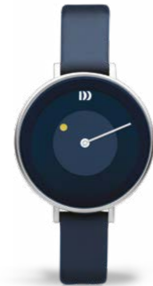
BLUE MEDIUM IV22Q1260