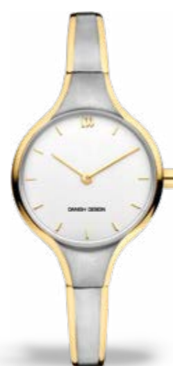
TWO-TONE INDEX IV60Q1276