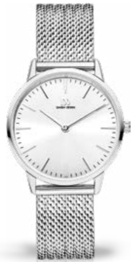
SILVER MESH IV62Q1251

CASE MATERIAL: Stainless Steel CASE DIAMETER: 32mm STRAP MATERIAL: Leather / Mesh Stainless Steel GLASS: Mineral Crystal WATER RESISTANCE: 3 ATM CASE THICKNESS: 6,2mm STRAP LOCK: Buckle / Push clasp STRAP WIDTH: 16mm MOVEMENT: Miyota GL20