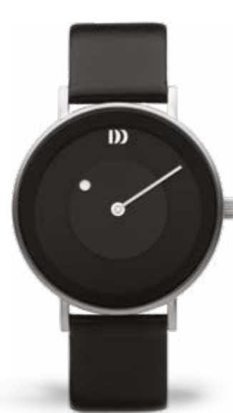
SILVER LARGE IQ13Q1260

CASE MATERIAL: Stainless Steel CASE DIAMETER: 35 MM / 39mm STRAP MATERIAL: Leather GLASS: Mineral Crystal WATER RESISTANCE: 3 ATM CASE THICKNESS: 6,8mm STRAP LOCK: Buckle STRAP WIDTH: 12 MM / 18mm MOVEMENT: Miyota 2025