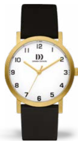
SATIN GOLD MEDIUM IV15Q1107