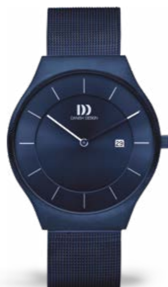
ALL BLUE LARGE IQ69Q1259