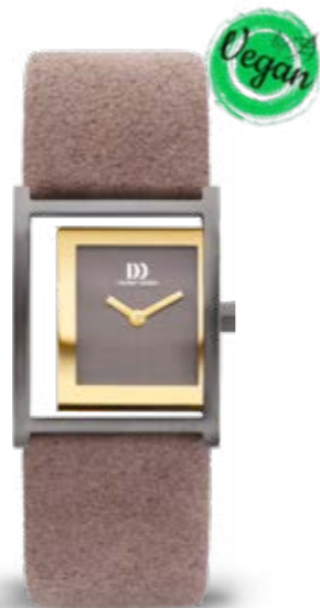
GREY GOLD IV16Q1292