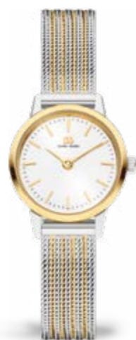
TWO-TONE GOLD IV65Q1268