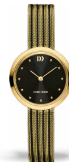
BLACK GOLD IV08Q1210