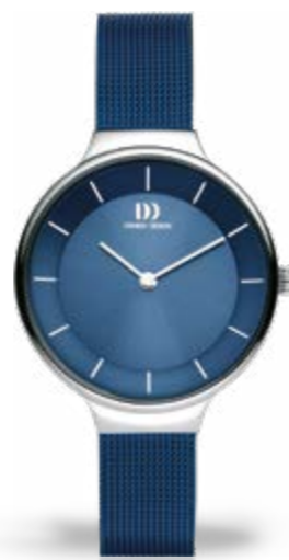
BLUE SILVER MESH IV69Q1272