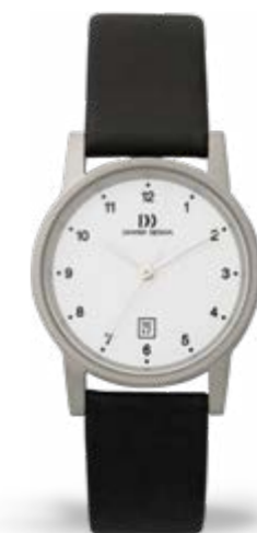
WHITE BLACK SMALL IV12Q170