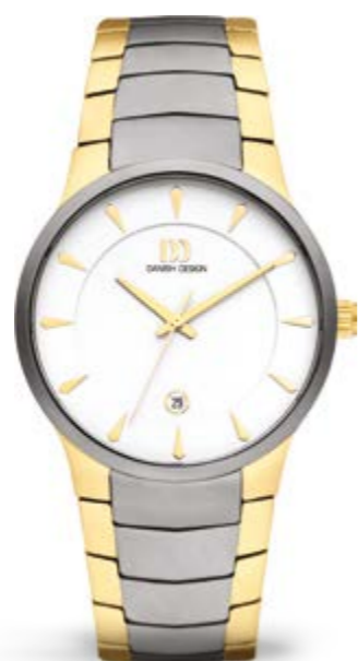
TWO-TONE LARGE IQ65Q1275