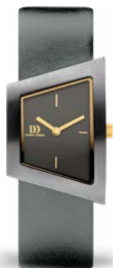
GREY GOLD IV16Q1207

CASE MATERIAL: Stainless Steel CASE DIAMETER: 26mm STRAP MATERIAL: Leather GLASS: Mineral Crystal WATER RESISTANCE: 3 ATM CASE THICKNESS: 7,3mm STRAP LOCK: Buckle STRAP WIDTH: 20mm MOVEMENT: Miyota 2025