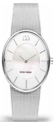
MOTHER OF PEARL SILVER IV62Q1168