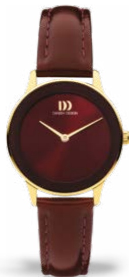
BURGUNDY GOLD IV27Q1288