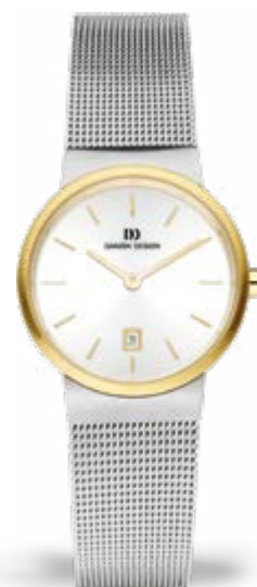
TWO-TONE SMALL IV65Q971