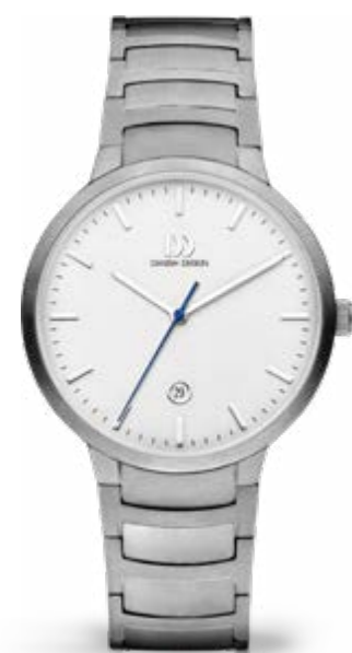
SILVER LARGE IQ62Q1278