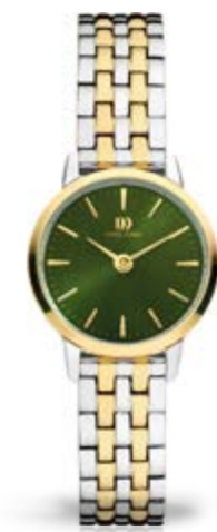
TWO-TONE GOLD GREEN LINK IV90Q1268