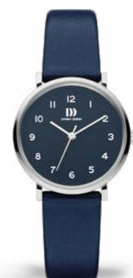
SILVER BLUE SMALL IV22Q1216