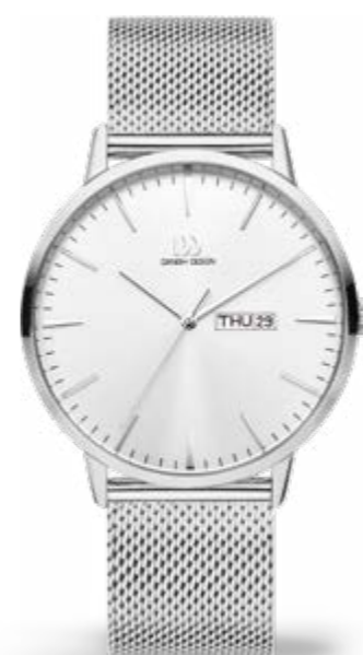
SILVER MESH IQ62Q1267