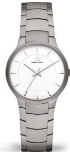
SILVER SMALL IV62Q1275

CASE MATERIAL: Titanium CASE DIAMETER: 32mm STRAP MATERIAL: Titanium GLASS: Sapphire Crystal WATER RESISTANCE: 5 ATM CASE THICKNESS: 7mm STRAP LOCK: Folding clasp STRAP WIDTH: 18mm MOVEMENT: Miyota GL30